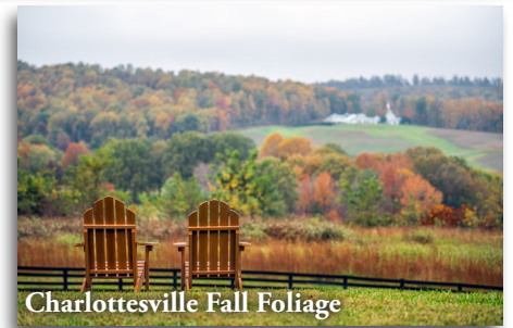
Charlottesville Fall Foliage