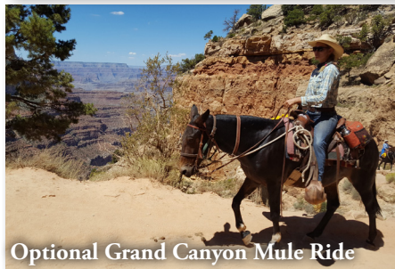
Optional Grand Canyon Mule Ride