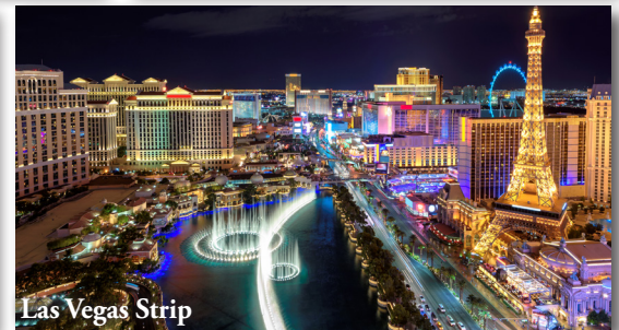
Las Vegas Strip