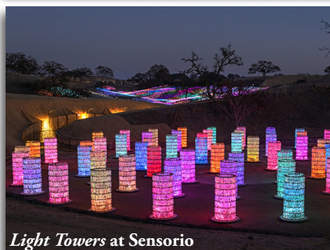
Light Towers at Sensorio