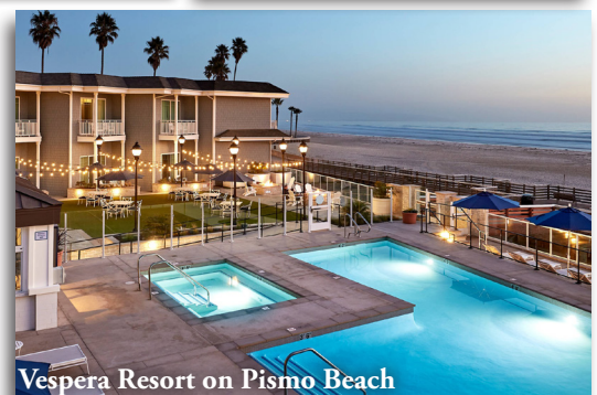
Vespera Resort on Pismo Beach