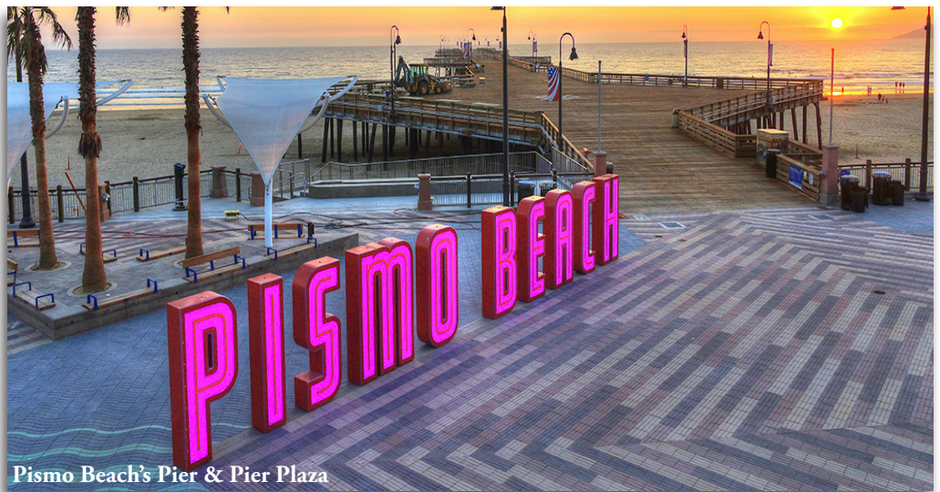
Pismo Beach's Pier & Pier Plaza