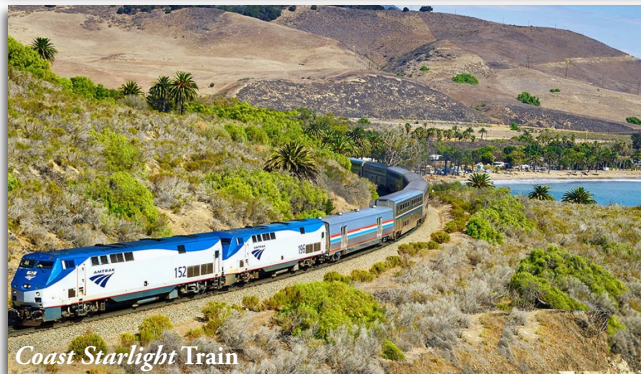
Coast Starlight Train

Double Occupancy: $999 per person Single Occupancy (no roommate): Add $450 Oceanview Upgrade: $175 p.p./dbl; $350 p.p./sgl