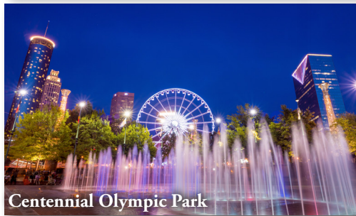
Centennial Olympic Park