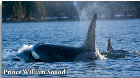
Prince William Sound