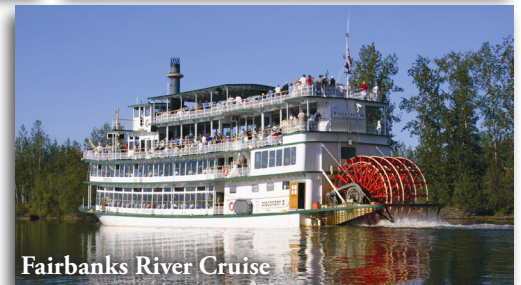
Fairbanks River Cruise