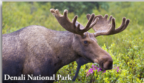
Denali National Park