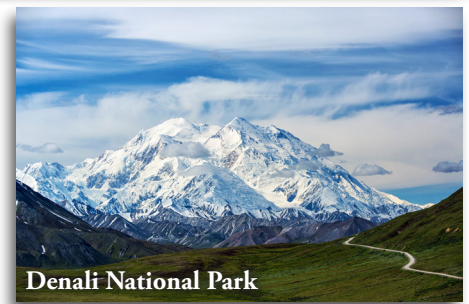
Denali National Park