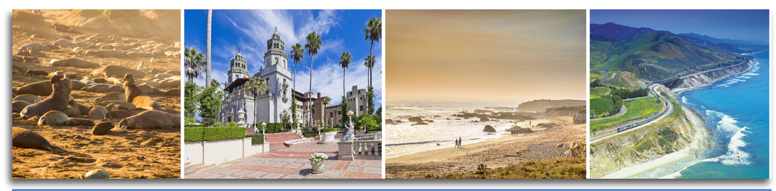
Good Times Travel Cambria & Hearst Castle by Rail

Featuring a Two-Night Stay at an Oceanfront Inn on Cambria's Moonstone Beach, Hearst Castle, Coast Starlight Train June 4-6, 2025 – 3 Day Tour