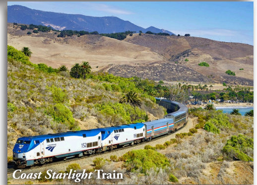
Coast Starlight Train