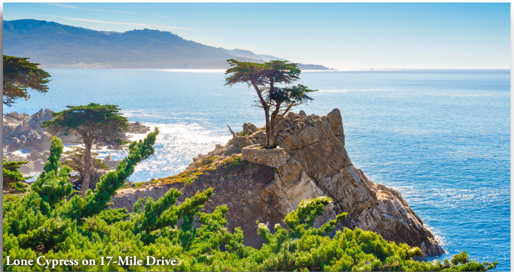
Lone Cypress on 17-Mile Drive