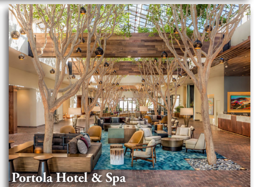
Portola Hotel & Spa