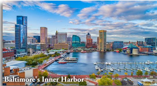
Baltimore's Inner Harbor

Double Occupancy: $1,999 per person Single Occupancy (no roommate): Add $800 Roundtrip airfare from $595 per person