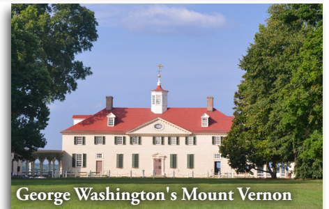
George Washington's Mount Vernon