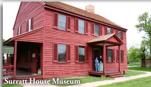
Surratt House Museum