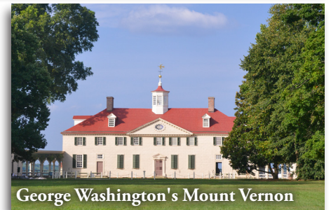
George Washington's Mount Vernon