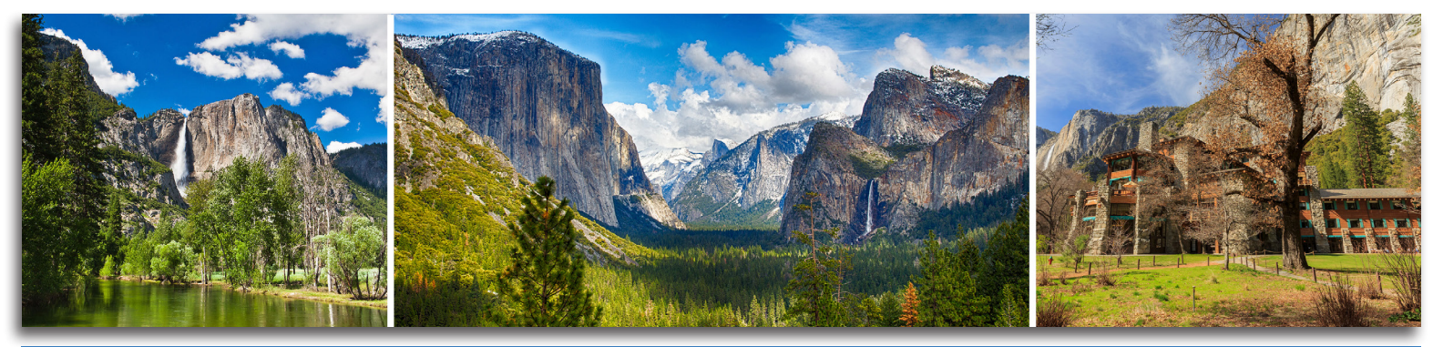
Good Times Travel Josemite Spring Fling Featuring a Two-Night Stay at Tenaya Lodge at Yosemite , Yosemite National Park, Sugar Pine Railroad , Basque Meal

Featuring a Two-Night Stay at Tenaya Lodge at Yosemite , Yosemite National Park, Sugar Pine Railroad , Basque Meal April 27-29, 2025 – 3 Day Tour