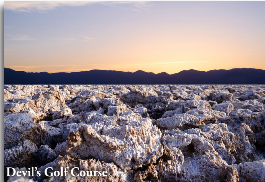
Devil's Golf Course