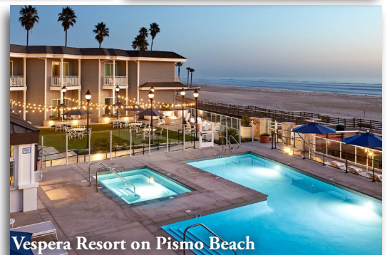
Vespera Resort on Pismo Beach