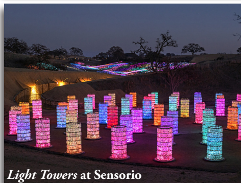
Light Towers at Sensorio

Double Occupancy: $949 per person Single Occupancy (no roommate): Add $400 Oceanview Upgrade: $175 p.p./dbl; $350 p.p./sgl