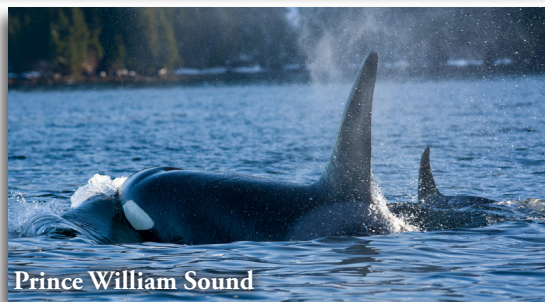
Prince William Sound