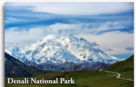
Denali National Park