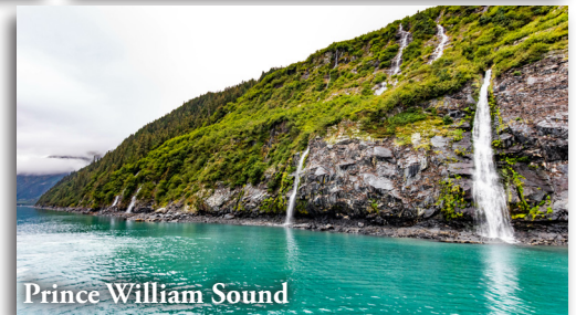
Prince William Sound