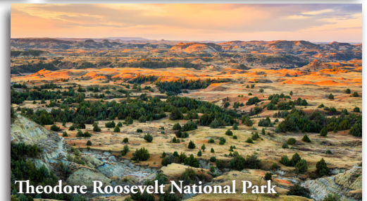
Theodore Roosevelt National Park