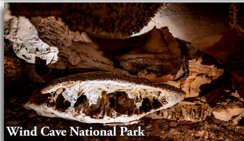
Wind Cave National Park