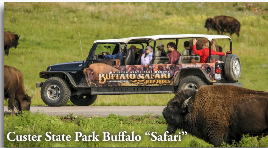
Custer State Park Buffalo “Safari”