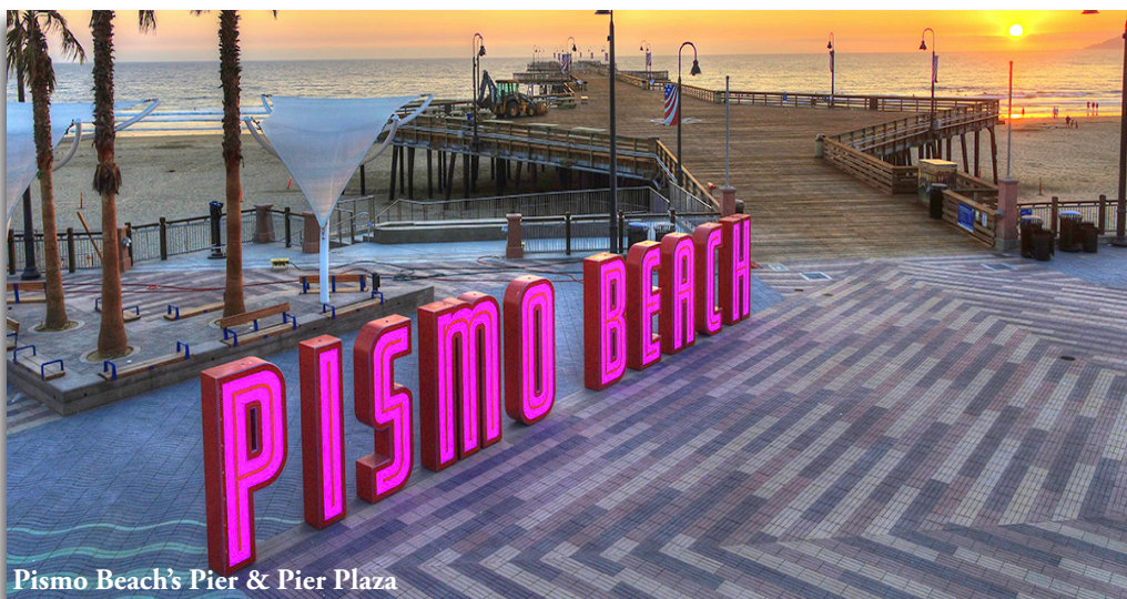
Pismo Beach's Pier & Pier Plaza