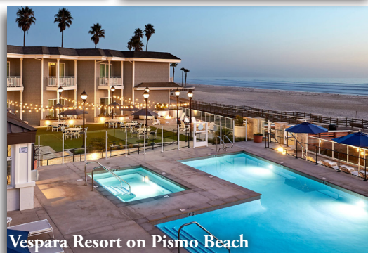
Vespera Resort on Pismo Beach