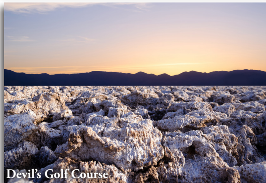
Devil's Golf Course