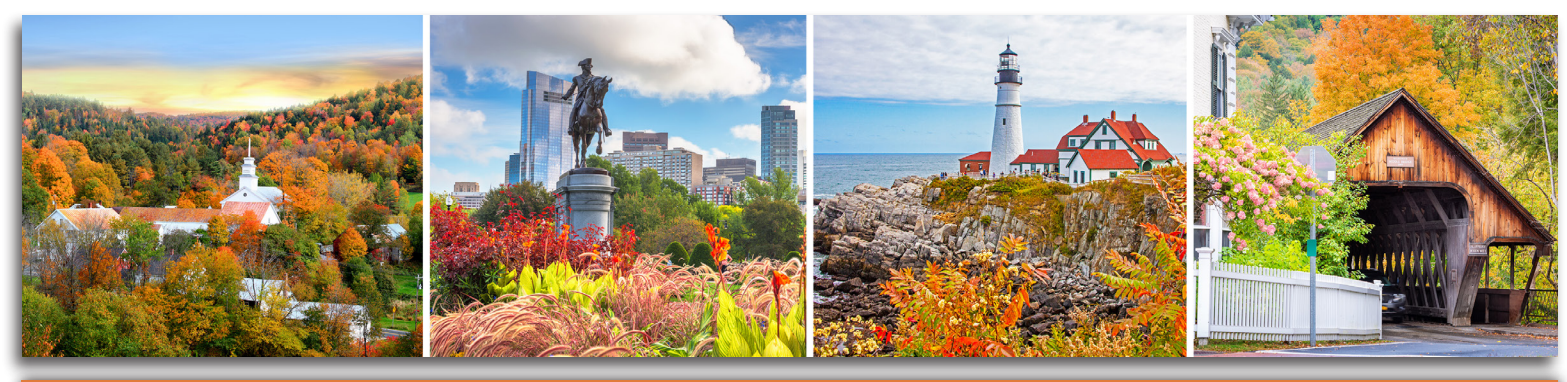
Good Times Travel New England Pall Poliage

Featuring Vermont, New Hampshire, Maine, Massachusetts, Boston, Portland, Kennebunkport, Killington, Hildene September 30–October 6, 2024 – 7 Day Tour